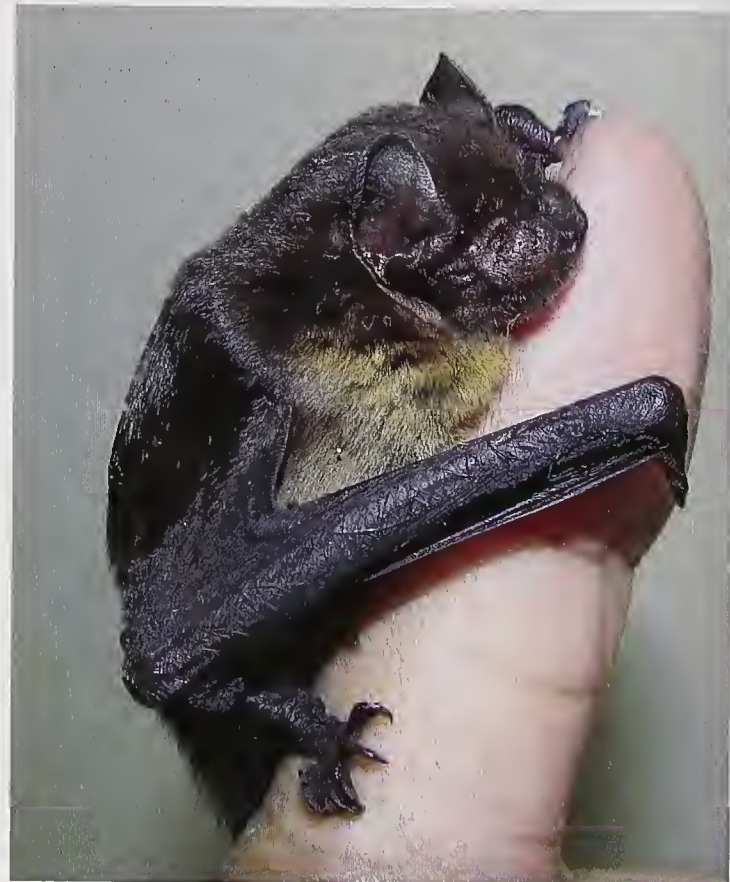
Fig. 1. Picture of the live adult male H. joffrei ZSI V/M/ERS/292. Note the dark brown, glossy appearance of the dorsal pelage, and the sharp demarcation between the dorsal and lighter ventral colour.

The preserved animal has long and narrow wings, much like those of Nyctalus spp., with the fifth digit being noticeably reduced (46 mm in total length) when